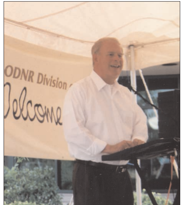
Governor Ted Strickland states Lake Erie is a jewel for Ohio and needs to be protected from Asian Carp.