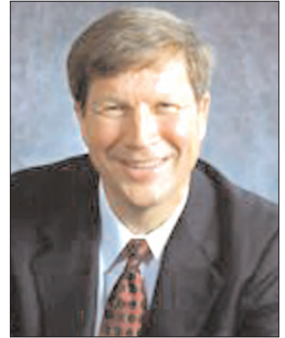
Ohio Governor-elect John Kasich